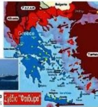
Τι γυρεύει η ναυαρχίδα των ΗΠΑ στη Θεσ/νίκη;